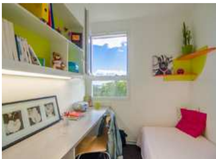
Example of a bedroom in the University Accommodation « Saint Antoine »